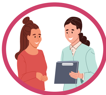
Staff who support you