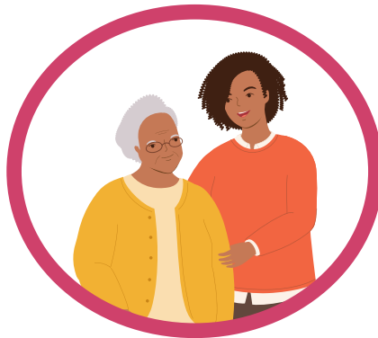
A social worker