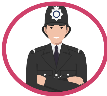
A Police Officer